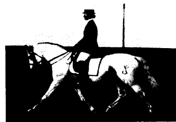
General Horse Sense Specializing in Dressage

South Wind Stables is an exciting new equestrian facility located 10 miles southwest of Granville, Ohio, and is conveniently close to I-70. We offer: Boarding, Lessons on your horse, Training of the young horse and schooling of the adult horse, as well as Lessons on our First and Second Level Dressage Schoolmasters.